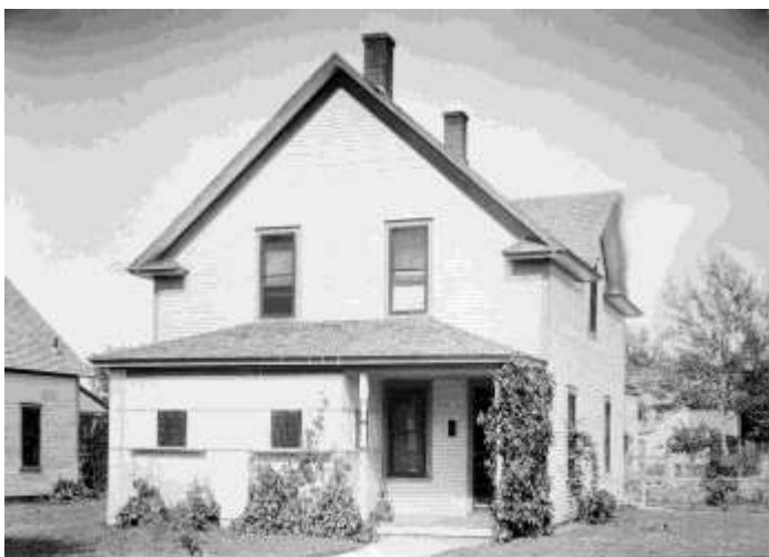
Miller home, Fort Morgan, CO

The numerous biographies (books, articles, and films) about Glenn Miller focus on his years of big band fame or his mysterious disappearance over the English Channel during World War II. In these accounts, Miller's high school years in Fort Morgan, Colorado have either been a passing remark or overlooked completely. "Glenn Miller: The Birthplace of His Music" fills this historical gap and explores in depth the significant cultural and musical influences Miller experienced in Fort Morgan from 1918-1921. Fresh research reveals that this small rural town in northeast Colorado provided Miller with a musical foundation that contributed to his success as one of the greatest band leaders of the swing era.